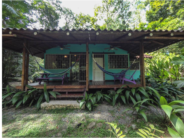
LOCATION OF THE PROPERTY calle Recope 1, Manzanillo Talamanca, Limón