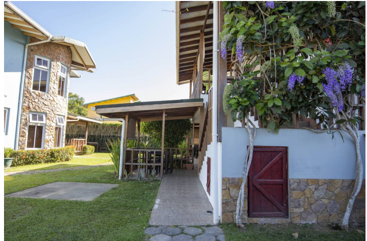
LOCATION OF THE PROPERTY Cahuita Centro 1, Cahuita Centro Talamanca, Limón