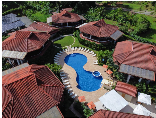
LOCATION OF THE PROPERTY Calle Azania 1, Puerto Viejo Talamanca, Limón