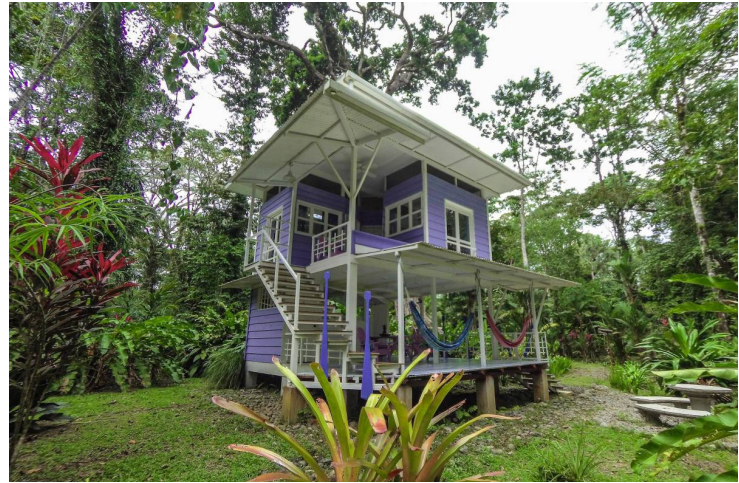
LOCATION OF THE PROPERTY Manzanillo Talamanca, Limón