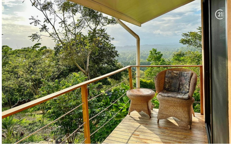
LOCATION OF THE PROPERTY , Puerto Viejo Talamanca, Limón