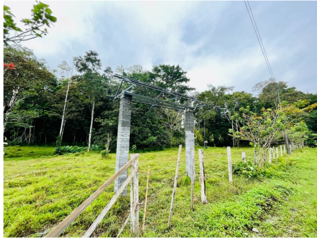
LOCATION OF THE PROPERTY , Puerto Viejo Talamanca, Limón

Agent: Info Caribe Mail: info@c21caribe.com T +506 8315 7245 C +50683157245