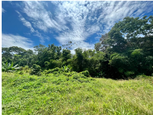
LOCATION OF THE PROPERTY Los Cielos, Playa Negra , Cahuita Talamanca, Limón

Agent: Info Caribe Mail: info@c21caribe.com T +506 8315 7245 C +50683157245