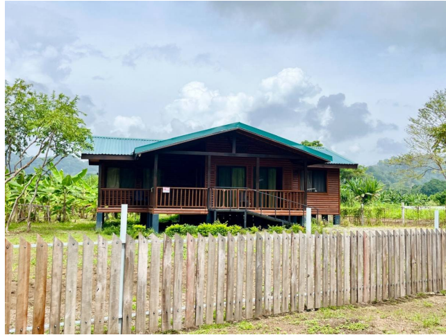
LOCATION OF THE PROPERTY Los Cielos, Playa Negra, Puerto Viejo , Cahuita Talamanca, Limón