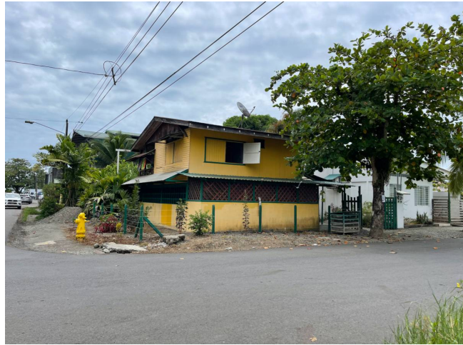
LOCATION OF THE PROPERTY Puerto Viejo Talamanca, Limón