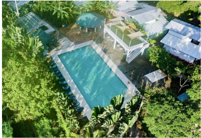
LOCATION OF THE PROPERTY Playa Negra - Banana Azul , Cahuita Talamanca, Limón