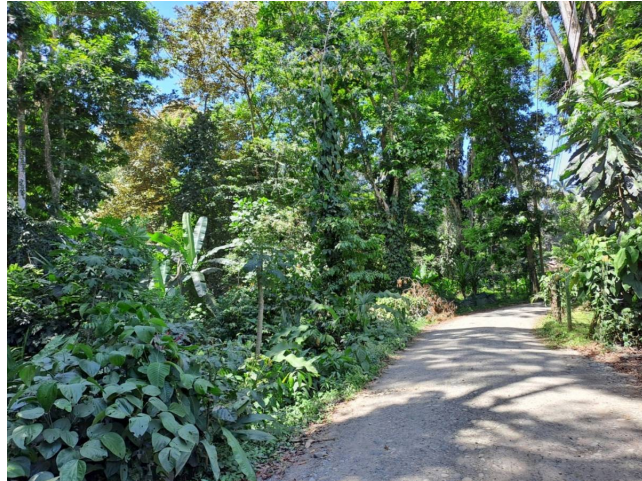
LOCATION OF THE PROPERTY Playa Negra de Puerto Viejo , Cahuita Talamanca, Limón