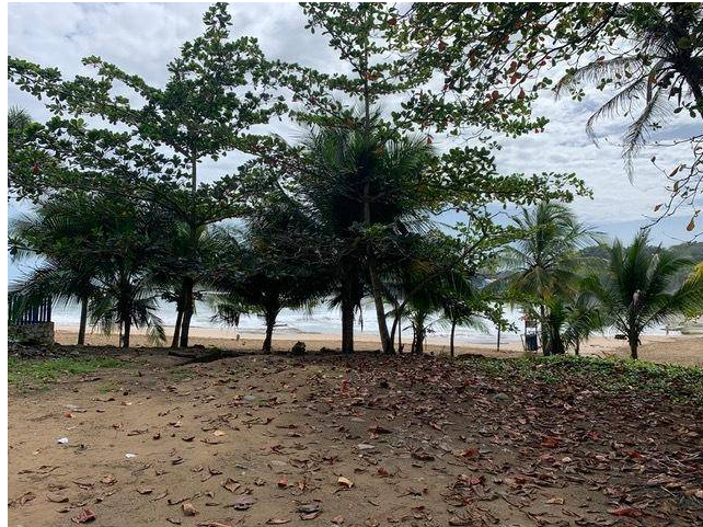
LOCATION OF THE PROPERTY playa bonita 1, Limón Limón, Limón