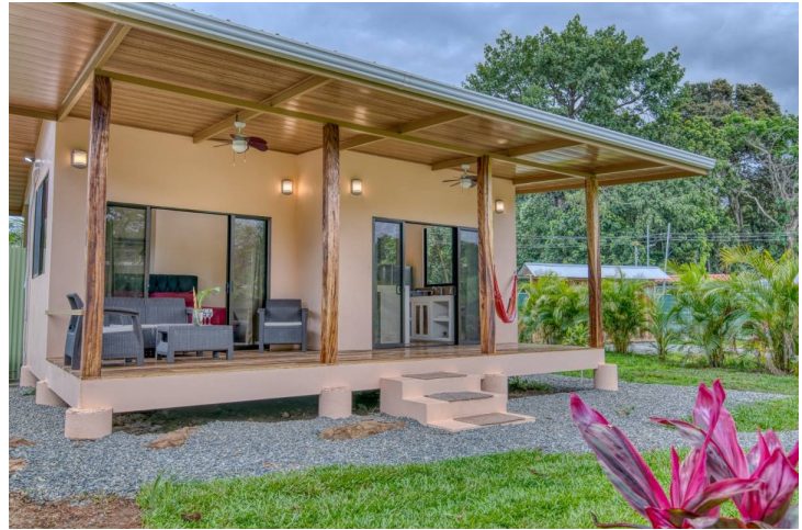
LOCATION OF THE PROPERTY Playa Negra , Cahuita Talamanca, Limón