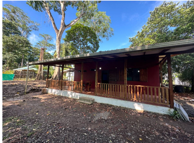
LOCATION OF THE PROPERTY Puerto Viejo Talamanca, Limón