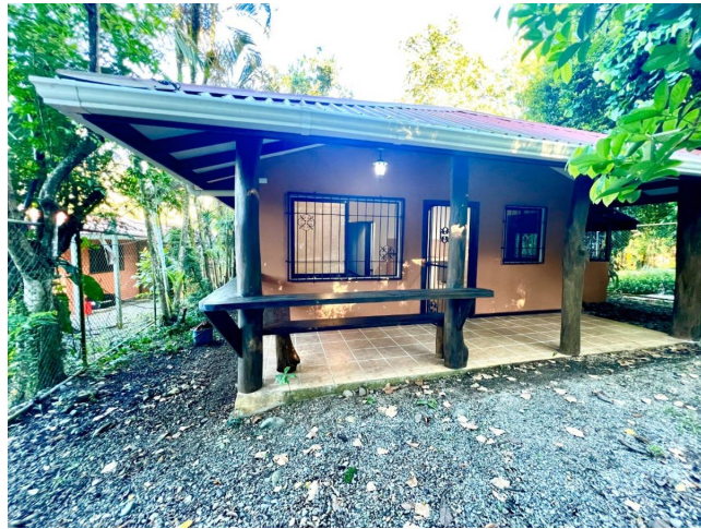
LOCATION OF THE PROPERTY Cahuita Talamanca, Limón