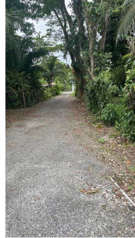
LOCATION OF THE PROPERTY , Manzanillo Talamanca, Limón