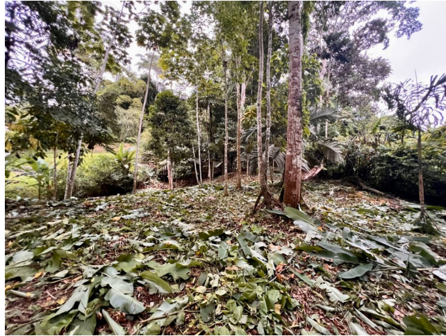
LOCATION OF THE PROPERTY Ole Caribe , Puerto Viejo Talamanca, Limón